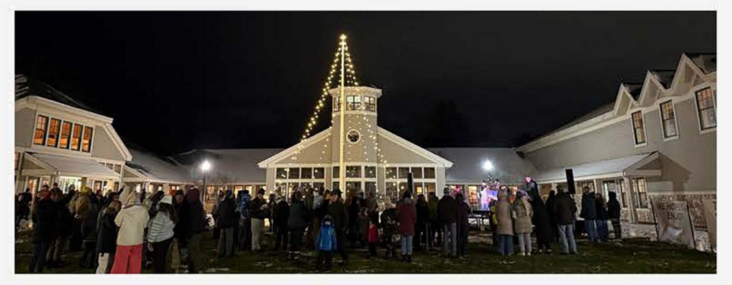
Over 1,000 Celebrate the Joy and Hope of the Season at The Heart of Christmas!

The holiday season came alive at Maranatha Bible and Missionary Conference on December 6-7, 2024, as over 1,000 residents gathered for the inaugural Heart of Christmas festival. This free, two-day event brought together families, friends, and neighbors for a celebration filled with holiday cheer and the hope found in the true meaning of Christmas.