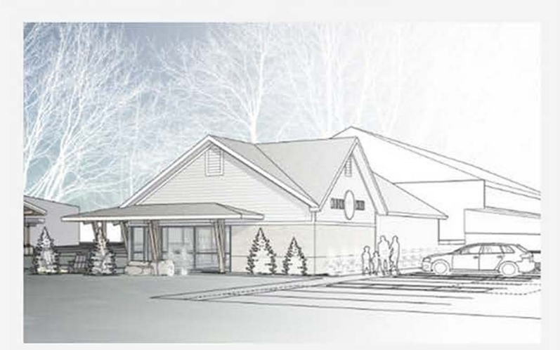
COFFEE SHOPPE & BOOKSTORE

You can order directly through the website or contact Gary Feenstra at (616) 836-5062 for assistance.