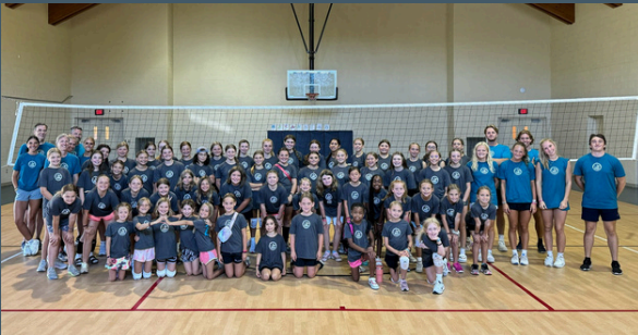
VOLLEYBALL CAMP 2024