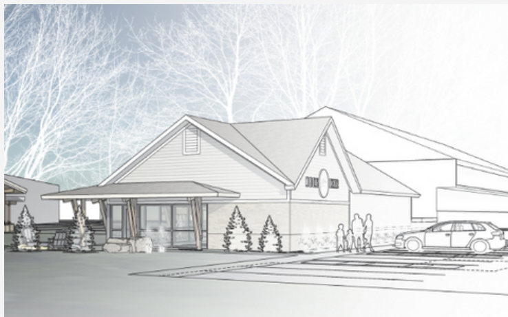
COFFEE SHOPPE & BOOKSTORE

Don't miss out on being a part of The Time To Rise project by buying a brick(s) to help build our beautiful patio in front of the renovated Tabernacle. It will take a lot of bricks, and we hope to have all our members and friends have at least one legacy brick in place.