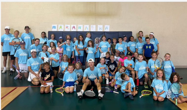
TENNIS CAMP 2024