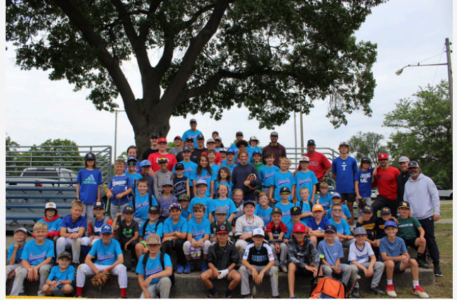
BASEBALL CAMP 2024