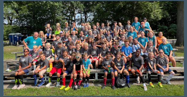
SOCCER CAMP 2024